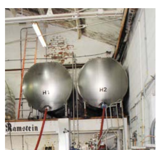
Horizontal Brite Tanks