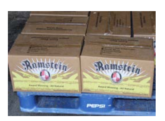
Cases of the Blonde Awaiting Distribution